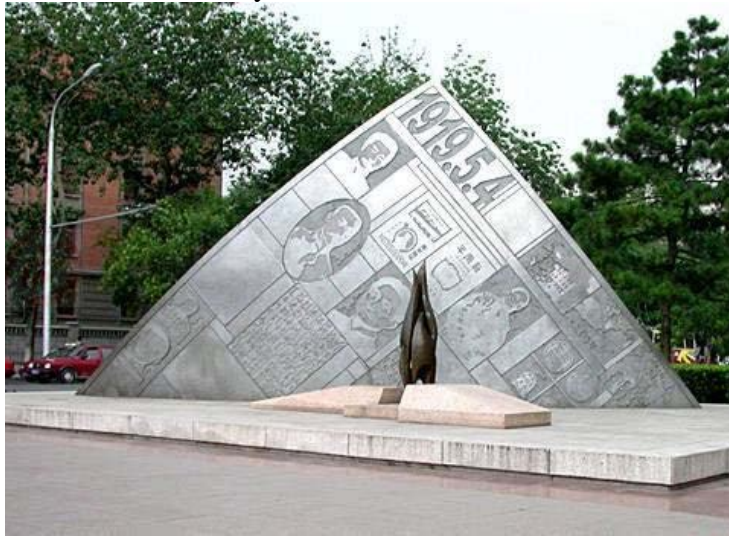
Figure 2 The May Fourth Movement Monument

the construction material when designing city sculptures. Because of the heavy color and texture of ancient copper, its visual effect is unified with the atmosphere of the old streets of the ancient city. Picture 2 shows the monument to the May 4th movement.